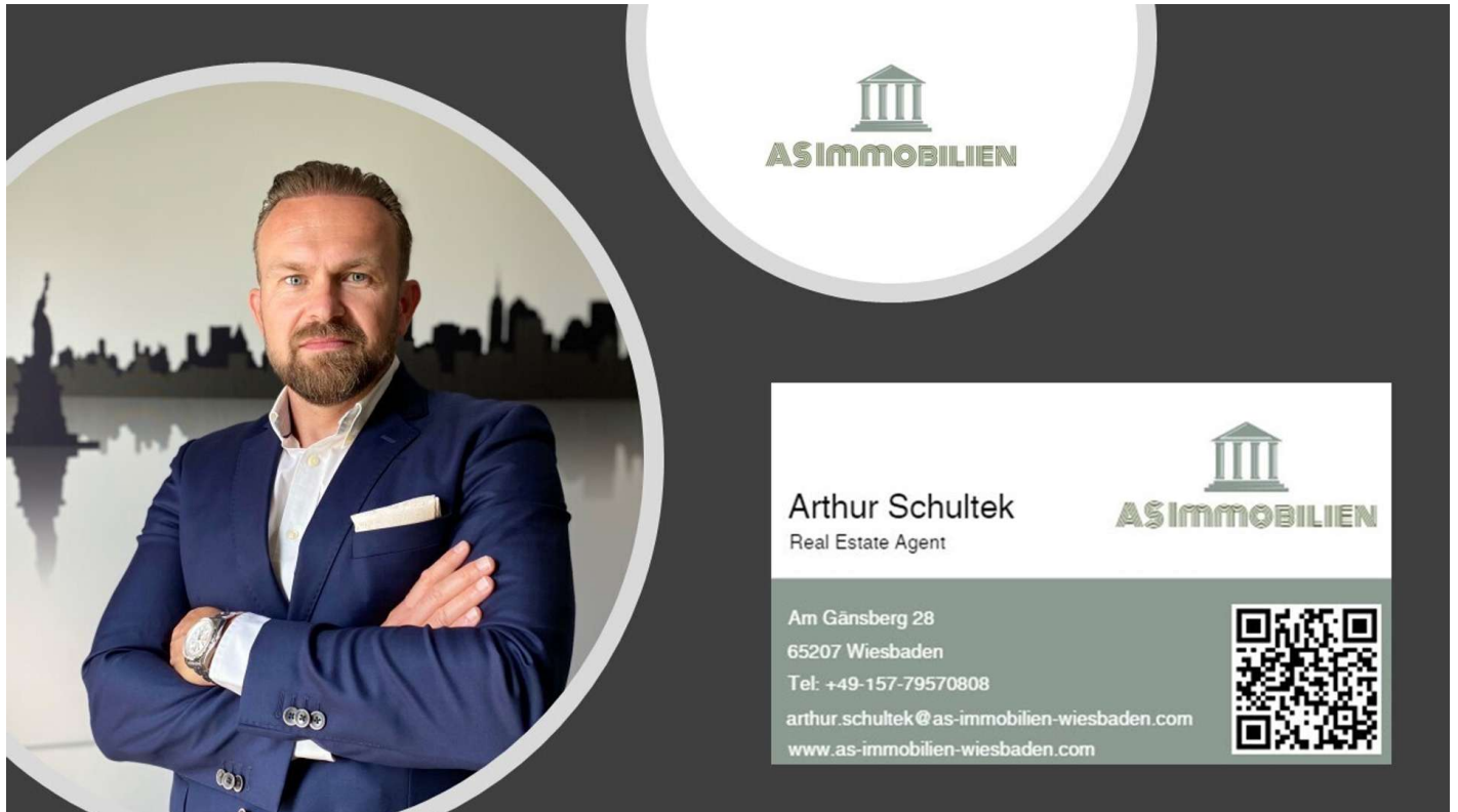
AS Immobilien Wiesbaden (2)