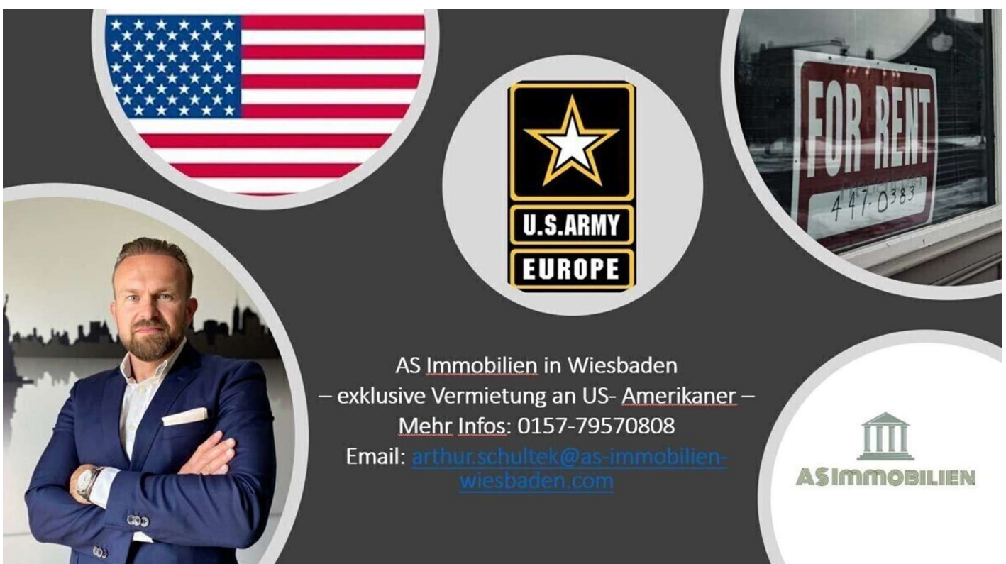
AS Immobilien Wiesbaden